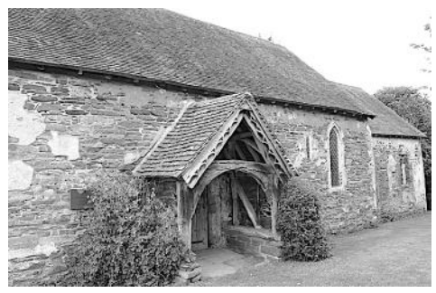
St Bartholomew's Old Church, Lower Sapey

Constant rain, intermittent flooding and treacherously slippery footpaths have curtailed my walking plans this winter. A country ramble in low sun on a bright, crisp day is usually a joy, distant views being enhanced by the lack of leafy foliage, but lately such opportunities have been few and far between. On a slightly less damp day than most, I ventured out on a circular walk which started at Leysters church and ended with an excellent allday breakfast at The Fountain Inn. The route took in some quiet lanes and passed another church along the way. I couldn't resist a quick look inside and was rewarded with a copy of a free magazine